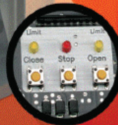
Built-in three push button station