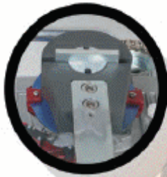
Fail-Safe / Fail Secure clutch mechanism

The standard specifications and features of this gate operator showcase the commitment made in its concept and design. Whether it's the simple, clean installation, energy efficient operation, or advanced battery backup function, this operator stands alone in it's class. This operator is UL Listed 18TC UL325 and UL991.