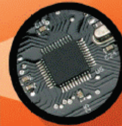
Soft-Stop / Soft-Start with intelligent Obstruction Detection